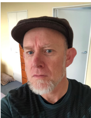
The Lockdown Look

Over and above this we plan to have face to face opportunities for our new principals to meet and discuss aspects of their new role with the Bishop, the Property manager, the Education Manager and The Religious Education Advisor. Through this process hopefully the new principals to our Diocese feel supported and connected.