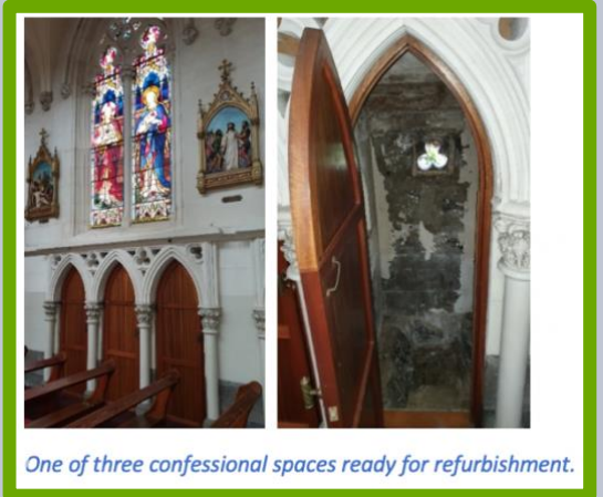
One of three confessional spaces ready for refurbishment.

A programme to undertake small but progressive improvements to St Joseph's Cathedral and surrounding environment is underway. Each project will however be subject to limited funding availability, but it is hoped in time additional radiance is added to an already impressive building. First-up is the refurbishment of the confessional spaces.