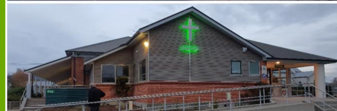
The recently completed re-clad project at St Mary's Milton.