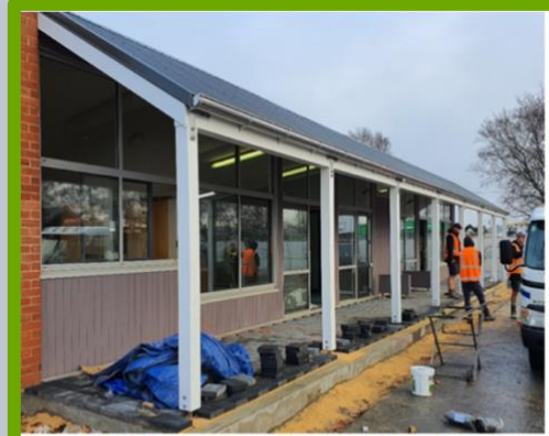
St Joseph's School Balclutha: Contractors busy themselves installing pavers under the new verandah whilst new windows and sliding door units receive final trim fit-out.

Following resumption of works after lock-down our Contractor, Calder Stewart has made excellent progress as this project nears completion. Work includes Parish funded refurbishment of part of their current accommodation space alongside the Schools co-joined classroom spaces.