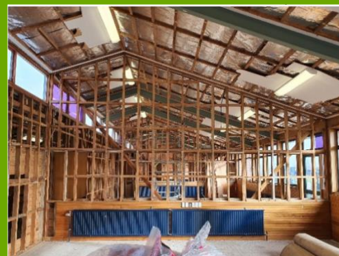
Main Block Stripped Out prior to reconfiguration.