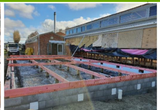
New Foundations to Classroom Extension.